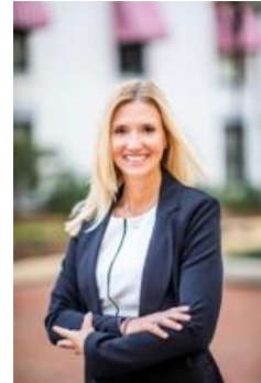
Marjory Stoneman Douglas Principal Named a 2019 Broward Education Foundation 'Hall of Fame' Honoree