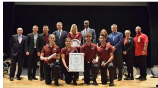
Marjory Stoneman Douglas' Eagle Regiment Marching Band invited to perform at London's 2021 New Year's Day Parade.