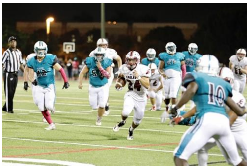
Marjory Stoneman Douglas Football Wins First District Title in 18 Years